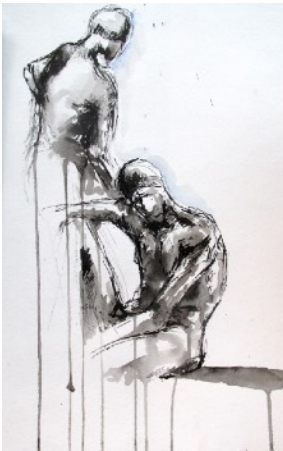
Figure Drawing (10th - 12th)

This advanced drawing class explores human anatomy, proportion, principles of movement, and form. In each class, students will have the opportunity to participate in different drawing exercises that will expand upon their current drawing foundation. Each class ends with a short group critique where students give each other feedback on their works.